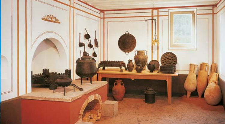
Kitchen with original amphoras

After severe damage in the Second World War, the Pompeiianum was restored in several stages, beginning in 1960. Since 1994, original Roman works of art from the State Antiquities Collections and the Glyptothek in Munich are now also on display here. Among the most valuable exhibits in addition to the Roman marble sculptures, small bronzes and glasses, are two marble thrones of gods. In addition, there is a different special exhibition every year on an archaeological topic. The Pompeiianum is surrounded by a small garden which was also only laid out in the mid-19th century. It was to be an 'ideal Mediterranean landscape', and still has a flavour of the warmer climes of southern Europe with its fig, araucaria and almond trees, as well as vines, Lombardy poplars and pines.