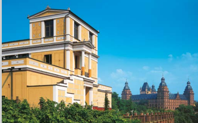
Pompeiiianum with Johannsburg Palace