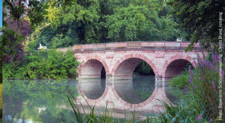
View of the Red Bridge from the Lower Lake

Temple of Friendship, shepherd's houses and a tiny village, a dining hall and a maintenance building as well as artificial 'hills' with a viewing tower and the Devil's Bridge. The neoclassical garden palace, built from 1778 to 1782 from plans by the architect Emanuel Joseph von Herigoyen, is aligned with and visible from Johannsburg Palace. Its ten state rooms with furniture in Louis-Seize style and the reconstructed coloured wall coverings printed using a complicated technique serve to illustrate the princely life style at the end of the 18th century. In the kitchen building of the park is a garden exhibition, open at weekends and on public holidays from April to September. It contains an exhibition on the fascinating history of this important landscape garden. Next to this building is a small garden with attractively planted flowerbeds.