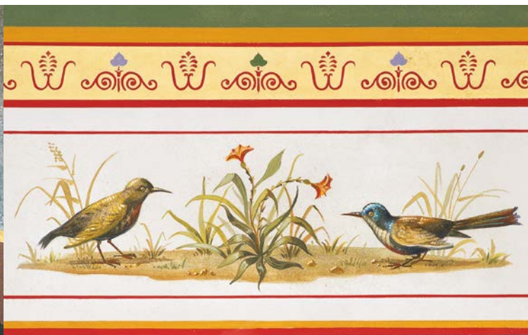
Detail of the reconstructed wall paintings in the Sacrarium

After severe damage in the Second World War, the Pompeiianum was restored in several stages, beginning in 1960. Since 1994, original Roman works of art from the State Antiquities Collections and the Glyptothek in Munich are now also on display here. Among the most valuable exhibits in addition to the Roman marble sculptures, small bronzes and glasses, are two marble thrones of gods. In addition, there is a different special exhibition every year on an archaeological topic. The Pompeiianum is surrounded by a small garden which was also only laid out in the mid-19th century. It was to be an 'ideal Mediterranean landscape', and still has a flavour of the warmer climes of southern Europe with its fig, araucaria and almond trees, as well as vines, Lombardy poplars and pines.