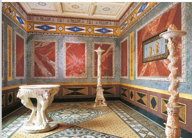
Summer triclinium (dining room) with stucco marble

In the Palace Garden on the high bank of the River Main is the Pompeiianum. Inspired by the excavations in Pompeii, King Ludwig I of Bavaria commissioned the architect Friedrich von Gärtner to build an idealized Roman villa, which was completed from 1840 to 1848 – not for himself but as a place where art lovers could make a study of ancient culture in their own country. On the ground floor are the reception and guest rooms, the kitchen and the dining room, grouped around two inner courtyards, the Atrium with its water basin and the Viridarium with its garden in the rear section of the house. The splendid decoration of the interior and the mosaic floors were copied or adapted from ancient models.