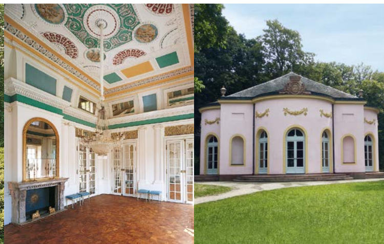
The hall in the palace (left); The dining hall in the park (right)

Temple of Friendship, shepherd's houses and a tiny village, a dining hall and a maintenance building as well as artificial 'hills' with a viewing tower and the Devil's Bridge. The neoclassical garden palace, built from 1778 to 1782 from plans by the architect Emanuel Joseph von Herigoyen, is aligned with and visible from Johannsburg Palace. Its ten state rooms with furniture in Louis-Seize style and the reconstructed coloured wall coverings printed using a complicated technique serve to illustrate the princely life style at the end of the 18th century. In the kitchen building of the park is a garden exhibition, open at weekends and on public holidays from April to September. It contains an exhibition on the fascinating history of this important landscape garden. Next to this building is a small garden with attractively planted flowerbeds.