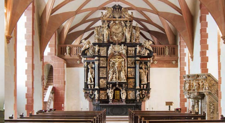
Altar of the palace church