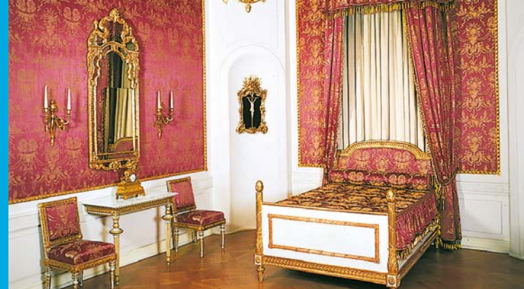
Bedroom in the Princely Apartments

Bayerischer Staatsminister der Finanzen und für Heimat