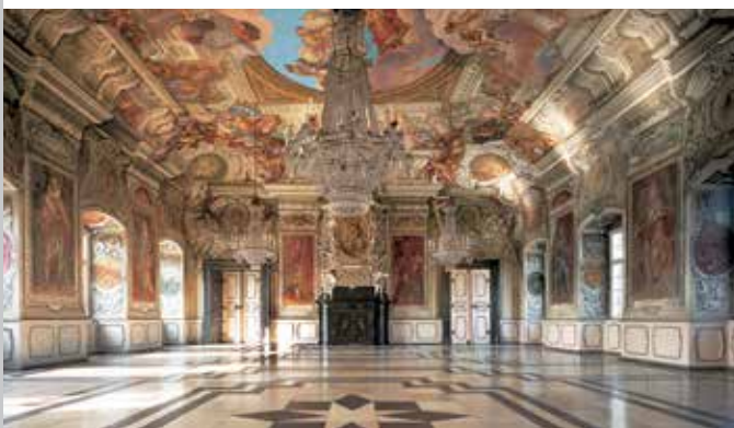
The Imperial Hall of the New Residence

by the two Renaissance wings at the rear with arcades on the inner courtyard side, which were built from 1604 to 1612. The New Residence was the first large palace to be built in Franconia in the age of absolutism. Until 1802 it was the seat of the Bamberg prince-bishops, who were not only heads of the church, but were also the secular rulers of the region.