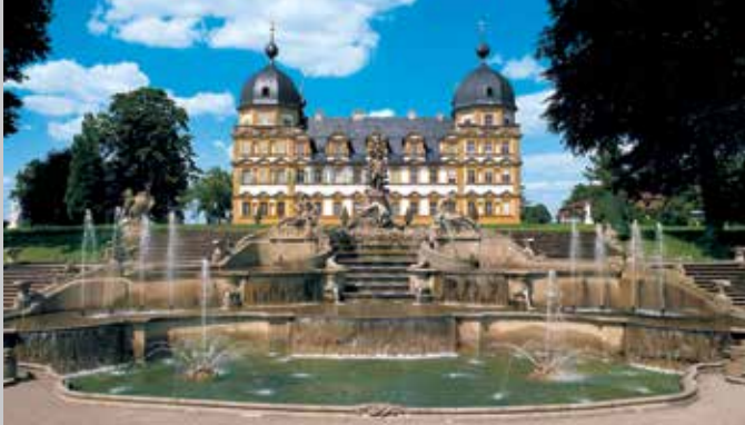
View of Seehof Palace from the cascade