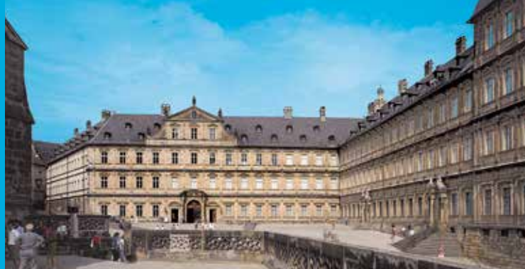
View from the cathedral square of the New Residence

Bayerischer Staatsminister der Finanzen, für Landesentwicklung und Heimat