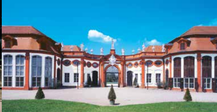
The orangery with the Memmelsdorf Gate