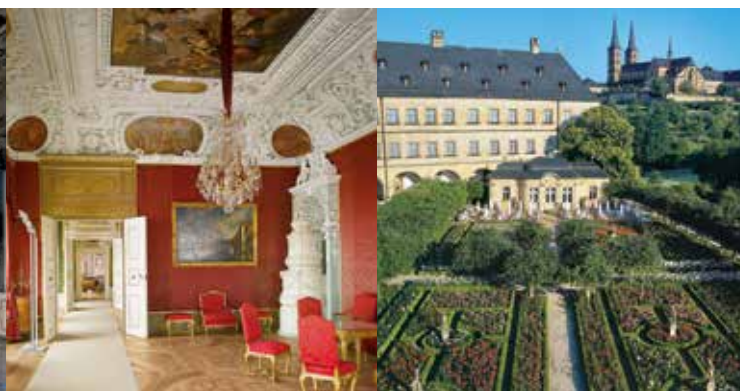
Former Audience Room (left); Rose Garden (right)

In addition to the Palace Department's period rooms in the New Residence, the 'Old German Gallery' and the 'Baroque Gallery' which are part of the Bavarian State Collection of Paintings, are well worth a visit. And visitors can relax afterwards in the inner courtyard of the Rose Garden with its café and magnificent view over Bamberg.